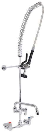
WALL MOUNT PRE-RINSE

FROM 6" TO 14" SWING SPOUTS, DOUBLE O-RING SPOUT SEAL, 1/4 TURN CERAMIC CARTRIDGES, POLISHED NICKEL CHROME FINISH, LEAD FREE, NSF, cCSAus.