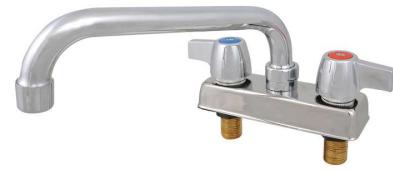
4" CENTER DECK MOUNT FAUCET

FROM 6" TO 14" SWING SPOUTS, DOUBLE O-RING SPOUT SEAL, 1/4 TURN CERAMIC CARTRIDGES, POLISHED NICKEL CHROME FINISH, LEAD FREE, NSF, cCSAus.