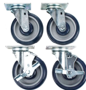
PLATE CASTER KIT

CASTER KIT, 5" casters (4 per kit) 2 WITH BRAKES, WITHOUT BREAK