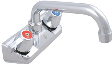
4" CENTER WALL MOUNT FAUCET

FROM 6" TO 14" SWING SPOUTS, DOUBLE O-RING SPOUT SEAL, 1/4 TURN CERAMIC CARTRIDGES, POLISHED NICKEL CHROME FINISH, LEAD FREE, NSF, cCSAus.