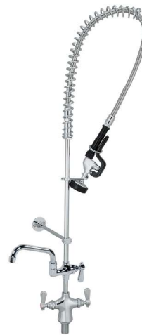
DECK MOUNT PRE-RINSE

PRE-RINSE ASSEMBLY, WITH ADD-ON FAUCET, SPLASH MOUNT, 8" O.C., TRIPLE PLY HOSE, ADD-ON FAUCET WITH 12" SWING SPOUT, 12" WALL BRACKET, 1/4 TURN CERAMIC VALVES, 1/2" FEMALE INLETS, LEAD FREE.